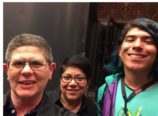
#14. Outfest Class Summer 2015 LGBTQS 183: Coming Out to the Movies: Los Angeles Queer Film Festival.