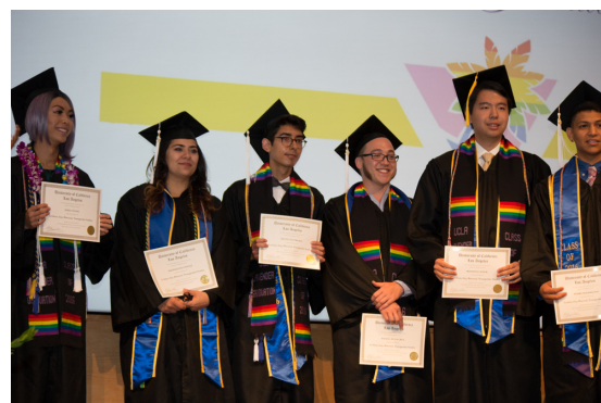
#12. Left. Class of 2016.